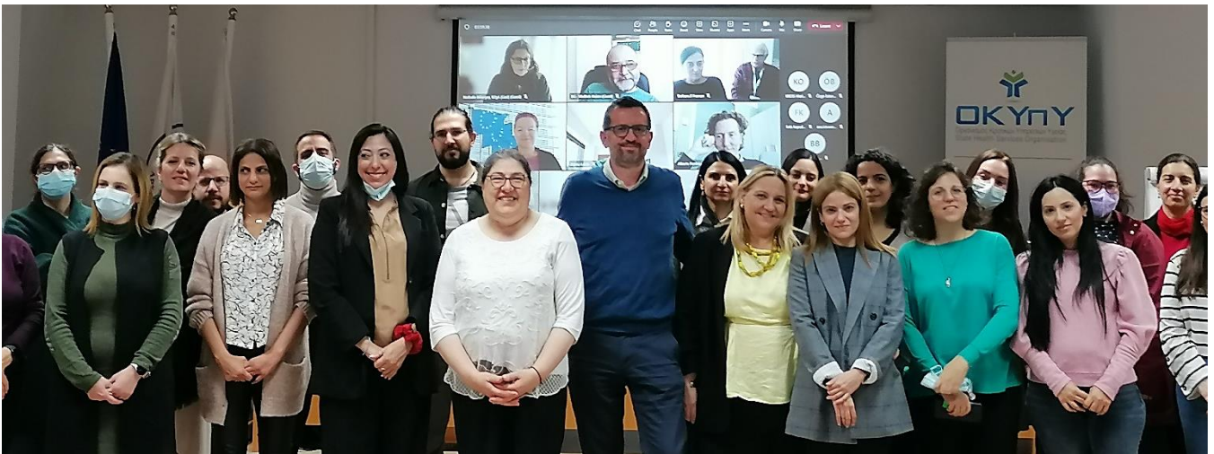
Picture 1. Group photo of JA IMPLEMENTAL team, training seminar participants, and members of the JA ImpleMENTAL Consortium.

On Thursday 23rd March 2023, a transnational hybrid meeting took place concerning the national implementation of the Belgian best practice on mental health system reform within the Framework of the EU Joint Action on Implementation of best practices in the area of Mental Health, JA ImpleMENTAL , aiming to facilitate the smooth transition from children's and adolescents' mental health services to adult services in Cyprus. The meeting took place in the conference room of Archbishop Makarios III Hospital, and it was well-attended by around 40 participants.