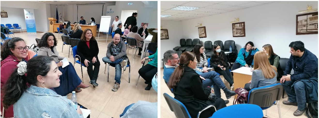
Picture 3. Brainstorming activity during workshop's training session.