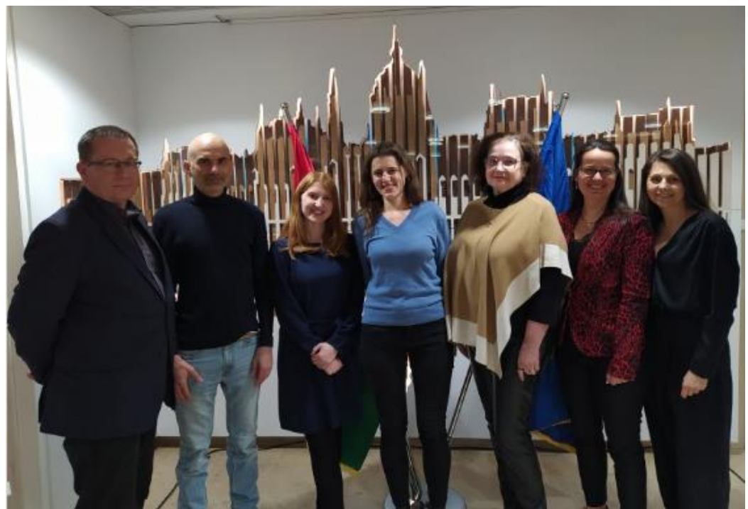
The Hungarian team of SU HSMT and NDGH- in Brussels

Over 30 European stakeholders actively participated in our collaborative efforts to develop the final recommendations for data altruism practices in the implementation of construction of national and European health data spaces, encompassing the concept of broad consent.